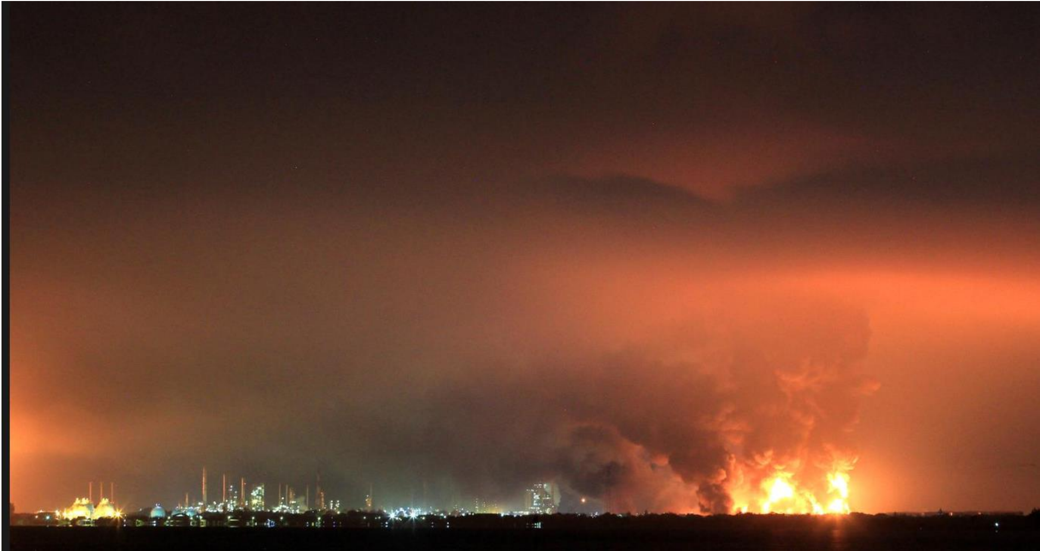
Smoke rises during fire at Pertamina's oil refinery in Balongan, Indramayu regency, West Java province, Indonesia, March 29, 2021 in this photo taken by Antara Foto. Antara Foto/Dedhez Anggara/ via REUTERS